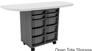
Open Tote Storage