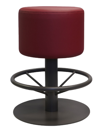
Powder coat: Stone 407 Fabric: Mayer Florentino Scarlet