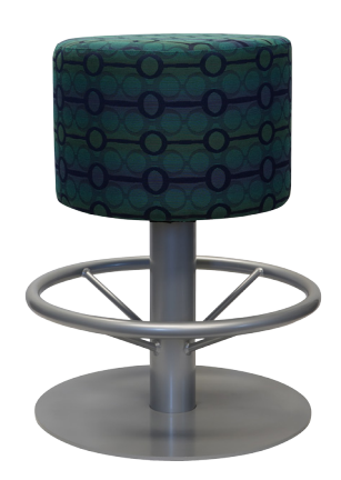
Powder coat: Silver 809 Fabric: Mayer Align Tattoo

Powder coat: Stone 407 Fabric: Mayer Galveston Sunset List Price: Grade 3 $1,021