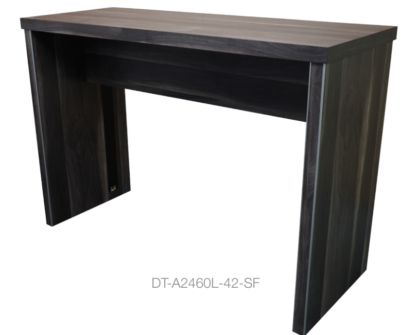
Overall Dimensions Depth: 24" Width: 60" Height: 42"

HPL: Formica Smoky Planked Walnut 7411-11 Standard Item List Price: $2932