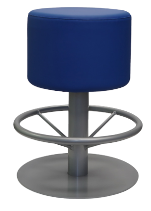
Powder coat: Silver 809 Fabric: Mayer Clean Slate Royal Blue