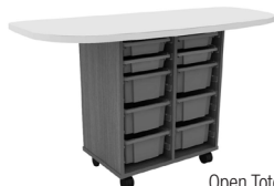
Open Tote Storage