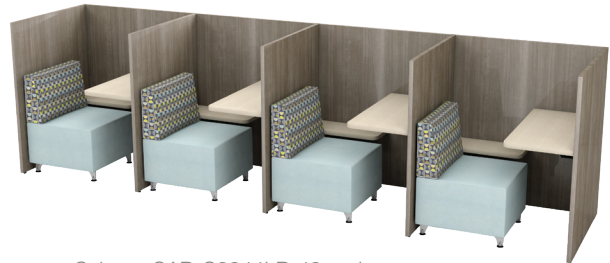
Cabana CAB-C3844LR-48 and (3) CAB-C3844LRA-48 Adder Units with Full Time Halfbacks FTSB2-24