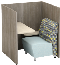
Cabana CAB-C3844LL-48 with ENA-2529