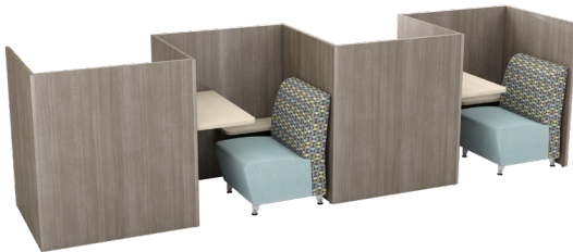
Cabana CAB-C3844LL-48 In a Zig-Zag Configuration with Engage ENA-2529s