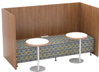
Cabana CAB-C3884L-48 shown in a Side-by-Side Kit with a custom Full Time Rectangle Ottoman and two O14OC-C0020-26 Orbit Laptop Tables and a connectivity panel