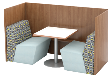
Cabana CAB-C3884DFL-48 in a Face-to- Face Kit with two Wink WNK-3030s and an Orbit O17-C3030-29 Table

*All Seating and tables sold separately.