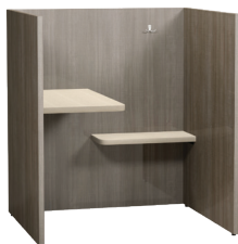
CAB-C3844LL-48 Double backpack hook is optional.