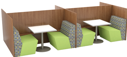
Double-faced Cabana CAB-C3884DFL-48 and CAB-C3884DFLA Adder unit shown in a Face-to-Face Kit with two Wink WNK-3030s and an Orbit O17-C3030-29 Table in each compartment