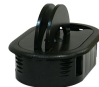
Table Top Mounting Bracket