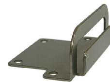
Table Side Mounting Bracket