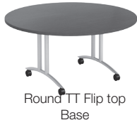
Round TT Flip top Base